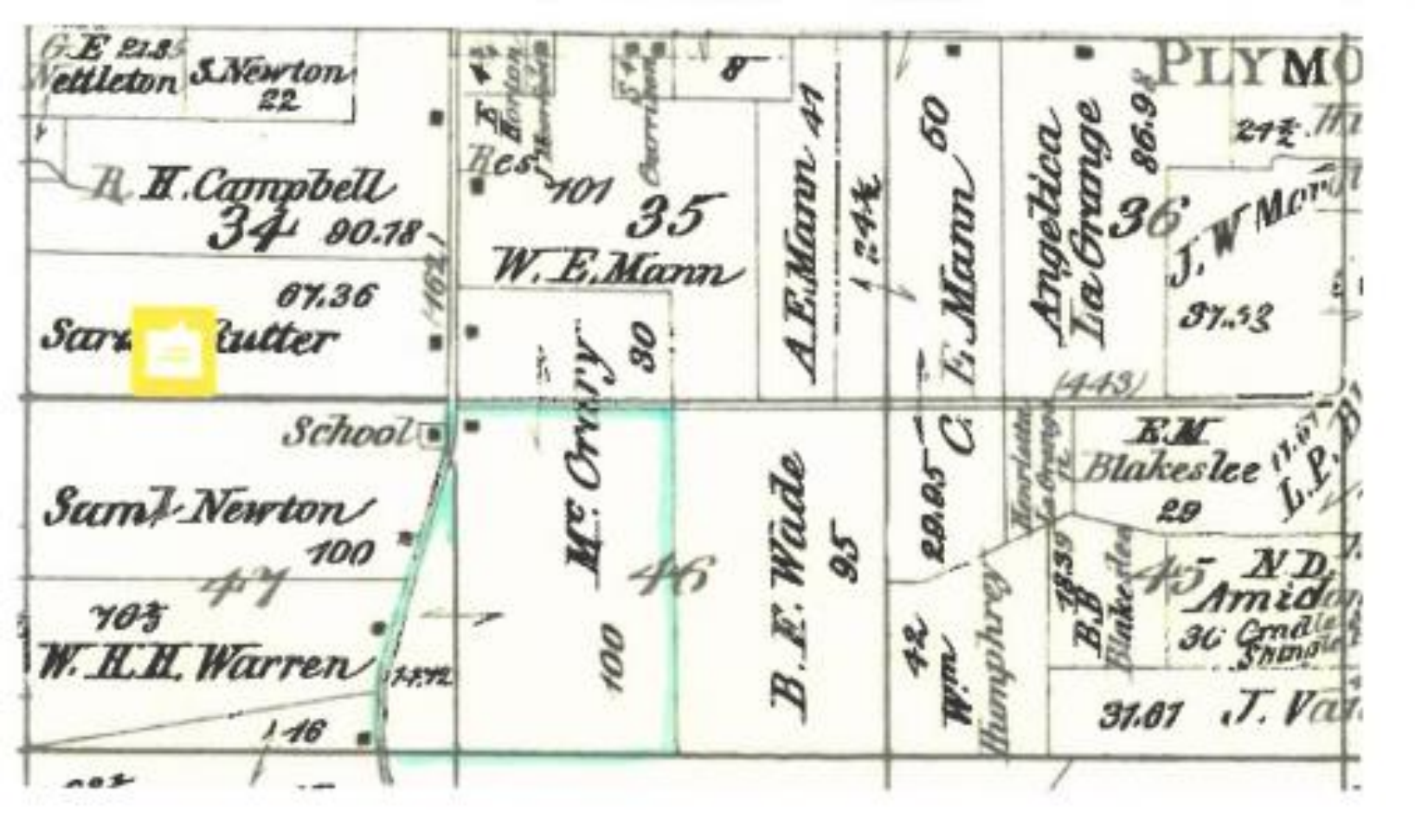
1874 ASHTABULA ATLAS